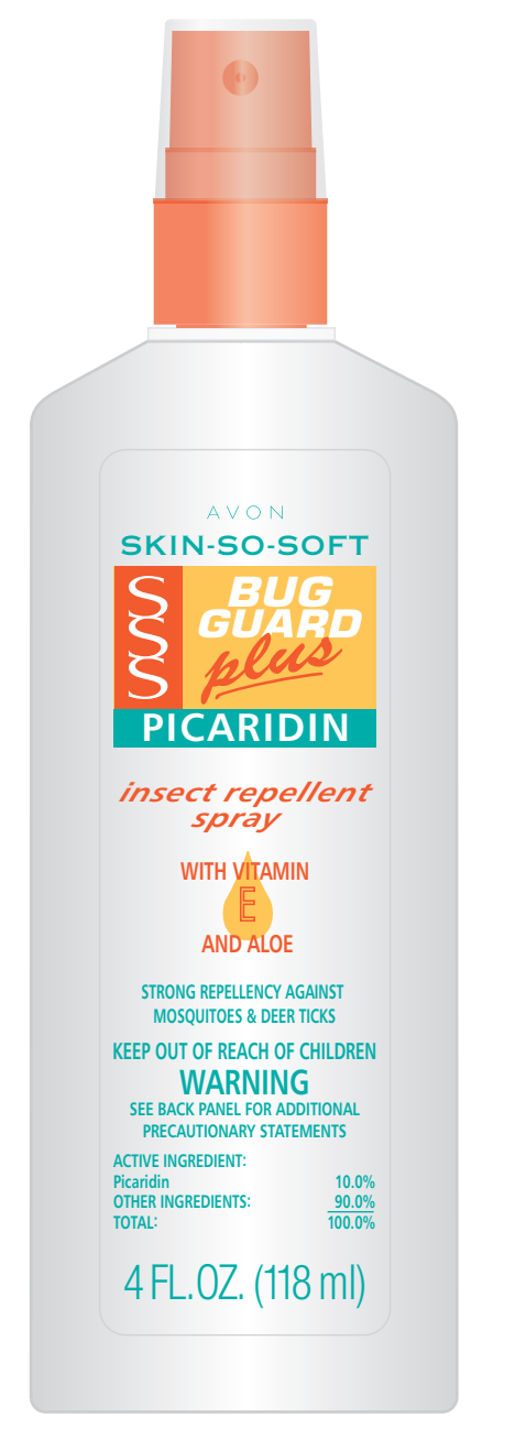
For Visualization Only