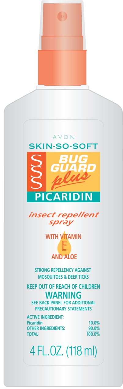
For Visualization Only